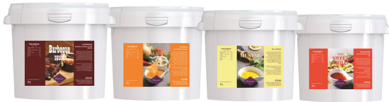
3 kg Pails