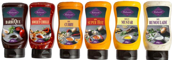
350-400 g PET bottle