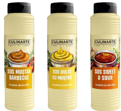
1 kg plastic bottle